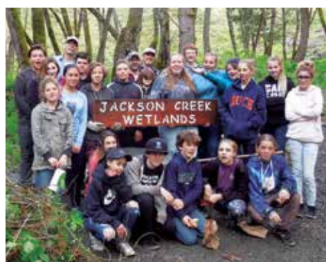
Great crew, and great job done!

“We look forward to regular work and fun visits with your students in the future