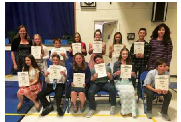
Applegate School's new inductees display their certificates from the National Junior Honor Society.