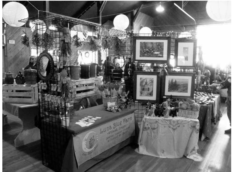
Pacifica's Annual Winter Arts Festival is always full of interesting items from local vendors.