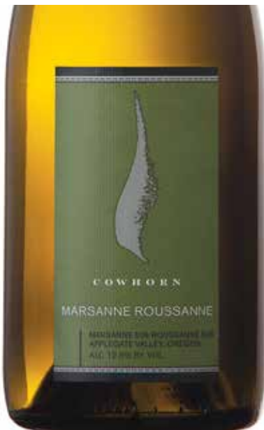
Cowhorn Vineyard Marsanne Rousanne blend.