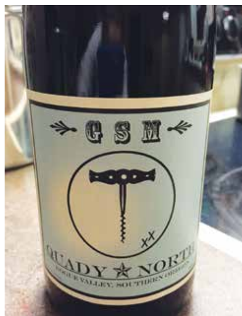
Quady North GSM (grenache, syrah, and mourvèdre) blend.