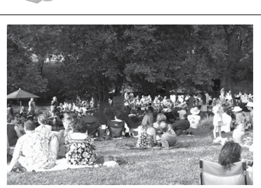
Concerts on the Beach at Red Lily Vineyards.