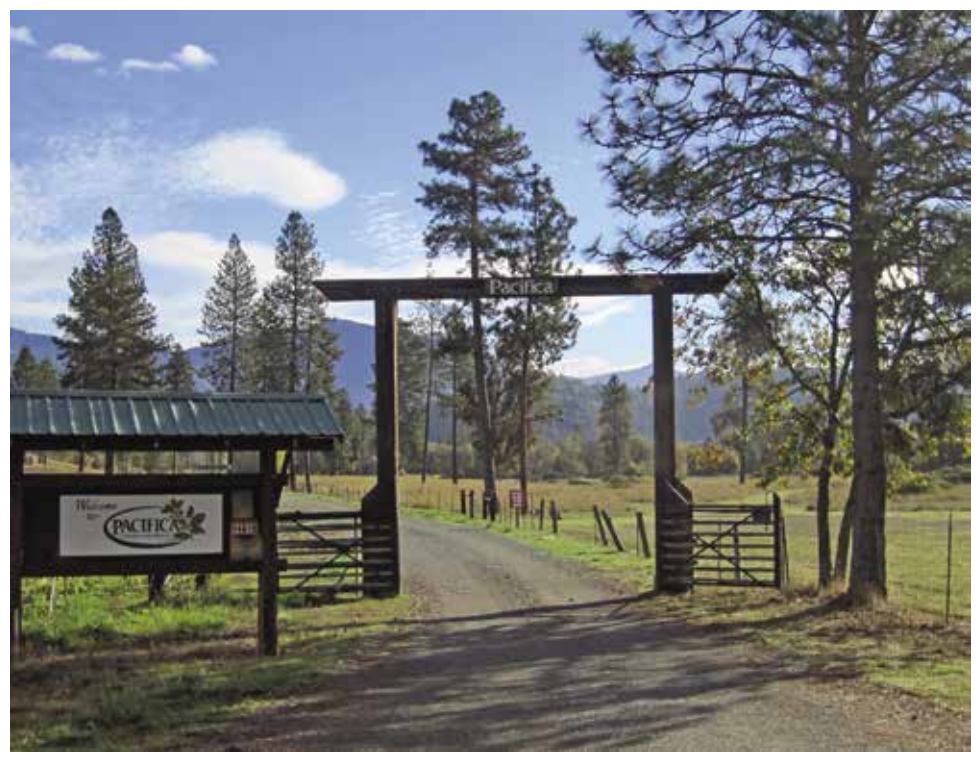
Pacifica, A Garden in the Siskiyous, is located at 14615 Water Gap Road in Williams.

More exciting news. Ground was broken for the long-awaited restrooms and showers. We've raised $100,000 for the exterior and are starting a campaign to raise the final $60,000 to finish the interior. A generous backer