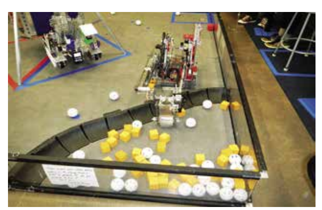
Tubby works furiously against the clock.