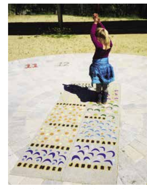
Young girl trying out the newly installed interactive sundial in Cantrall Buckley Park.

I want to thank you for all the wonderful compliments about the new features in the park-the art sculptures, the new plantings-and how good the park looks in general. It is a wonderful example of the partnership of our community's generous donors and willing volunteers working alongside the Jackson County Parks management.