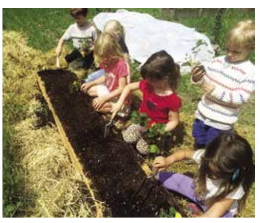
The SCA garden is tended by children who attend the Forever Flowering Kindergarten there.

The Sugarloaf Resource Center, an all-ages space for culture and learning, welcomes public visitors to SCA land on Mondays and Thursdays from 3:30 -6:30 pm and Sundays from 1:30 - 6:30 pm. The resource center provides a cozy environment for self-directed and social learning and hosts a collection of