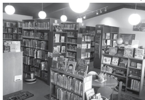
The Williams branch library.