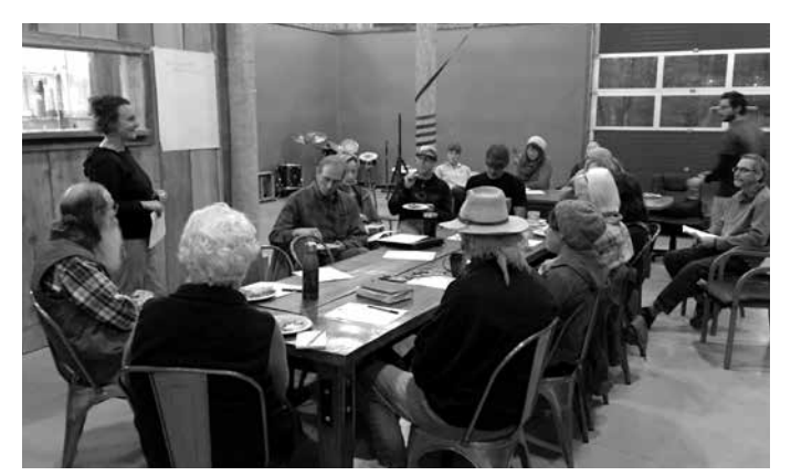
Applegate community members share ideas at a neighborhood listening session.

The neighborhood listening sessions will be supplemented by visioning sessions at our Applegate Valley Nonprofit Network