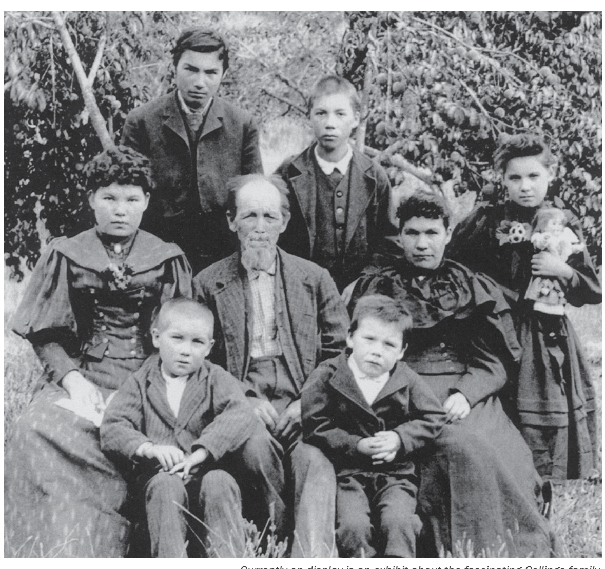
Currently on display is an exhibit about the fascinating Collings family.