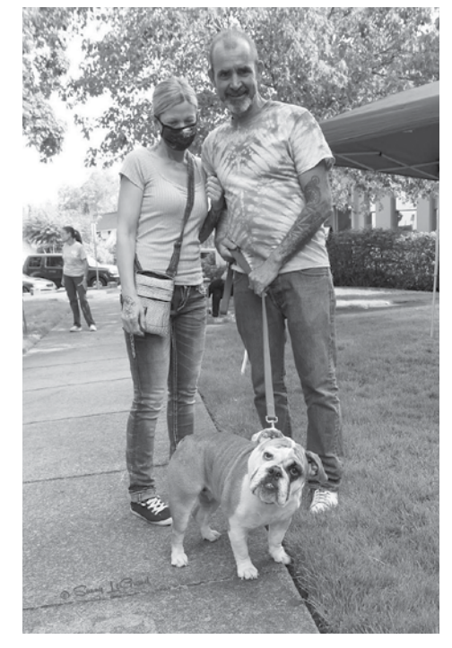
One of many canine visitors at the FOTAS Crafts Fair.

Applegaters immediately responded to a call for help. Several were already at the Expo by the afternoon of September 8 to help care for evacuated animals and take a few home to foster. They transported six large-breed dogs and three cats to Sanctuary One in Upper Applegate; Sanctuary One assumed responsibility for rehoming these pets.