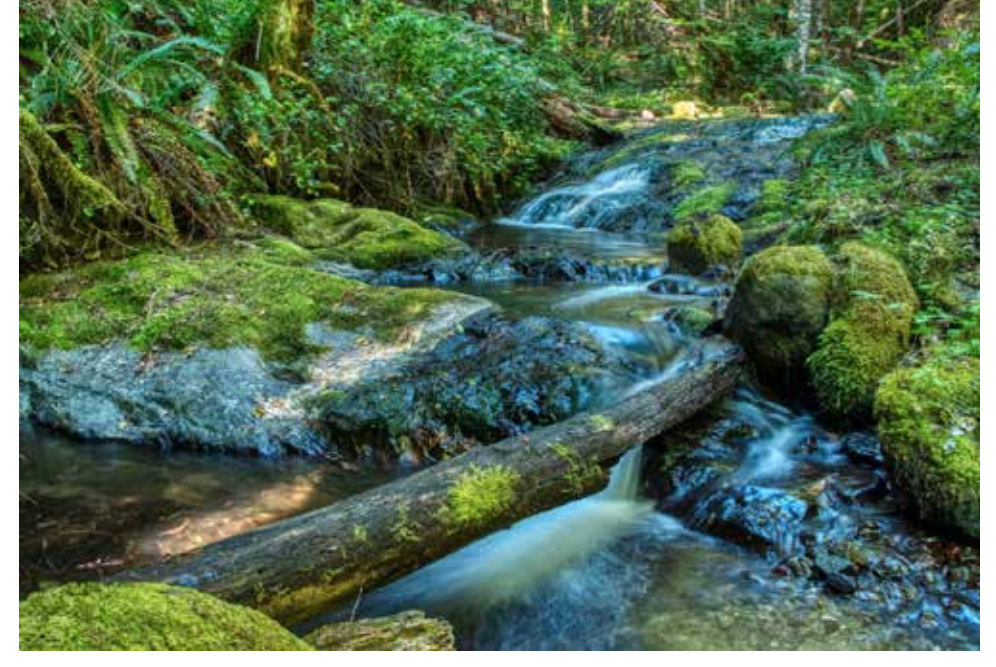
Pipe Fork is the name of a creek that flows into East Fork Williams Creek south of Williams.

(3) Clear-cuts, by exposing the forest floor, limit the land's ability