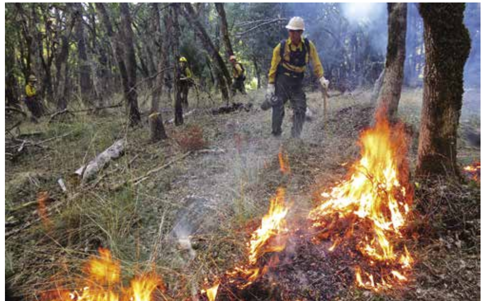
The OSU Fire Program seeks to partner with local communities to support the use of prescribed burning.