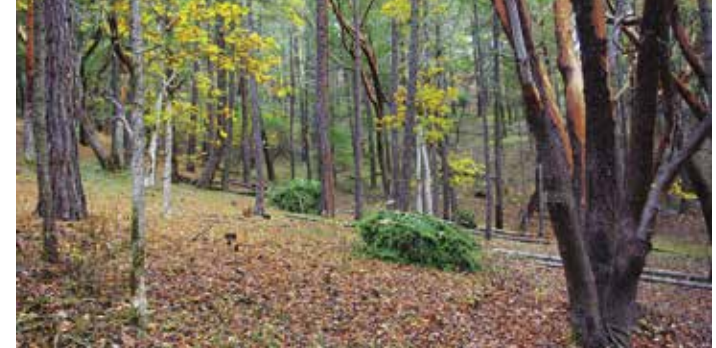
A treated stand with piles ready for a controlled burn. There's a low load of surface fuels and a high canopy base height.

Oregon State University scientists have worked up a preliminary Atlas of Potential Control Lines for a portion of the Rogue Basin showing the best places to stop a fire (blue) with somewhat less effective places (green). These control lines are almost always roads. This zoomed-in detail of the Sterling Creek Road area shows a blue area at the upper right, which is the relatively nonflammable streets and landscaped yards of Jacksonville. Running from the upper right towards the lower left is Griffin Lane and Sterling Creek Road (highlighted in green).