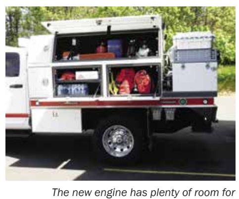
medical supplies.

This type-six engine also has more water capacity, better pump capacity, and a hose size that allows firefighters to "pump and roll" (yes, just as it sounds—apply water to a spreading fire as you roll along the edge of the fire). It also has a unique feature that is invaluable: there is a Cascade system in the vehicle, which allows firefighters to refill their breathing apparatus on the scene of a structure fire, so that they can get back to the fire more quickly. The new #8563 is also easier to operate, maneuver, and drive. (Not to mention to train new firefighters as drivers!) Our fire district was established in the 1980s. The goal was to provide timely responses to both structural and forest fires in the Applegate. Today our fire district has seven stations across the Applegate Valley. Staff and volunteers respond to fires, accidents, injuries, illness, and other emergencies. With #8563 now in service out of headquarters, the plan is to have an identical new type-six engine stationed on the west side of our district in the coming months. (But don't jump out of your seats!