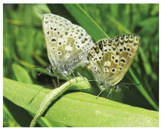
Male (left) and female Sierra Nevada Blue (aka Gray Blue) butterflies share a perch.

Lakes, I am concerned about the danger to the moist meadow habitats on the Siskiyou Crest in the headwaters of our watersheds. A beautiful butterfly living in some of our most beautiful landscapes is a treasure we should try to protect.