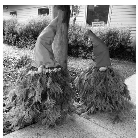
You can learn how to make a forest gnome at Ruch Library.

When COVID-19 protocols permit, our Preschool Storytime will start at 11:30 am Tuesdays. The Babies and Wobblers Storytime (zero-three years), an early