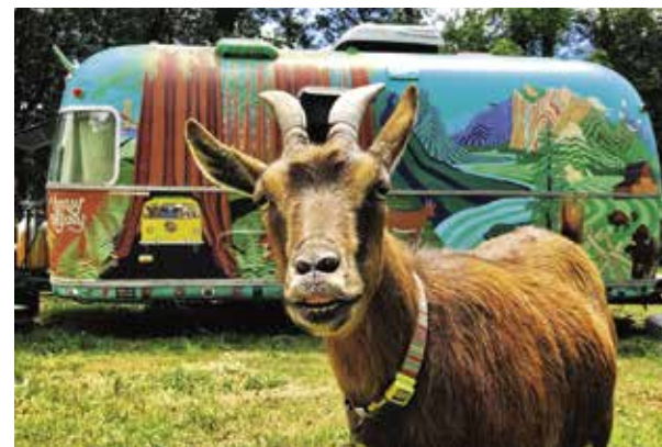
Frankie and the Argosy Odyssey trailer at their Applegate home base.