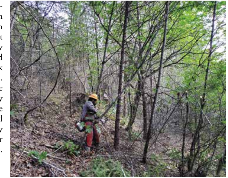
Earlier this year, Lomakatsi Restoration Project crews worked on 100 acres of ecological fuels reduction in the Applegate Watershed project area.

Within the units reviewed, noncommercial tree removal was limited