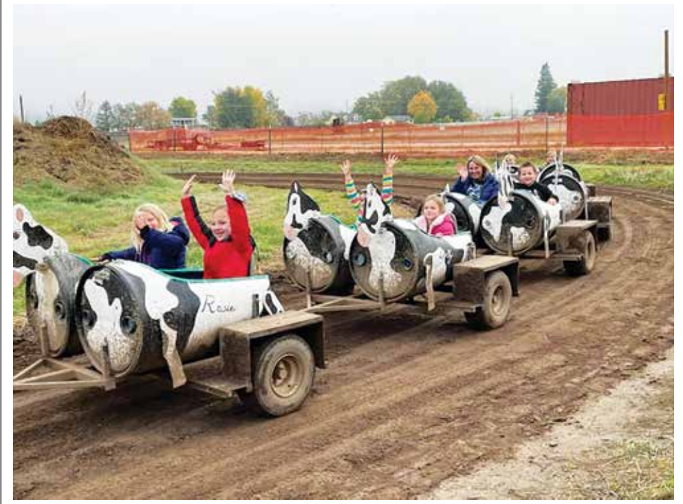
Younger students from Williams Elementary School have a blast at the Fort Vannoy Farms pumpkin patch and corn maze west of Grants Pass.