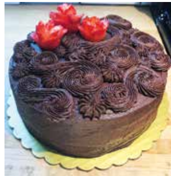
A vegan, gluten-free hazelnut cake from Paulazzo Pasticceria.

Whether you had Curly Top shortbread or a vegan cupcake for dessert at lunch, now, on your way back to the Applegate from your afternoon shopping, you can’t help yourself: you stop at the Provolt Store again for an afternoon treat—a giant