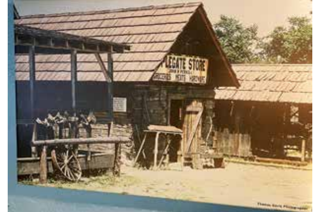
An early photo of the Applegater Store hangs in the current store.

com and its Facebook page at business.facebook.com/ApplegateStoreAndCafe .