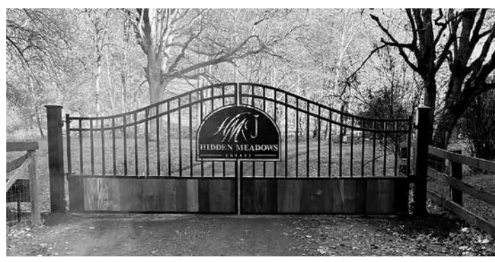
The gate at Hidden Meadows.

Hidden Meadows is not just a boarding and training facility. We are a family looking to bring back to ourselves and those around us the simple joys in life. We are here to bring back the connection to nature, horse, rider, and oneself. Once you drive through the masterfully wrought gates at Hidden Meadows, you