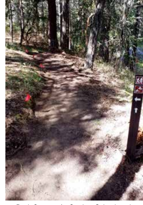
Ruch Community Outdoor School students have finished their work on this section of trail at Cantrall Buckley Park.