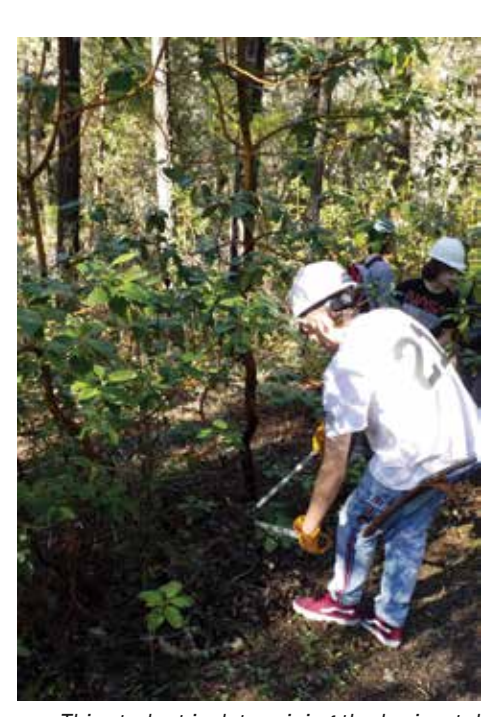
This student is determining the horizontal clearing line and removing limbs and small new growth that is in the tread zone. They also learned the vertical clearing limit for this trail in the campground.

The third-graders' small groups set to work weeding three landscaped beds that were overgrown in English ivy, Himalayan blackberries, vinca, and grass. They were all industrious workers and completely filled 17 large recycled feed sacks. They begged their teacher to be able to come back again. As a member of A Greater Applegate's Park Committee and an APWC board member, I coordinated this project.