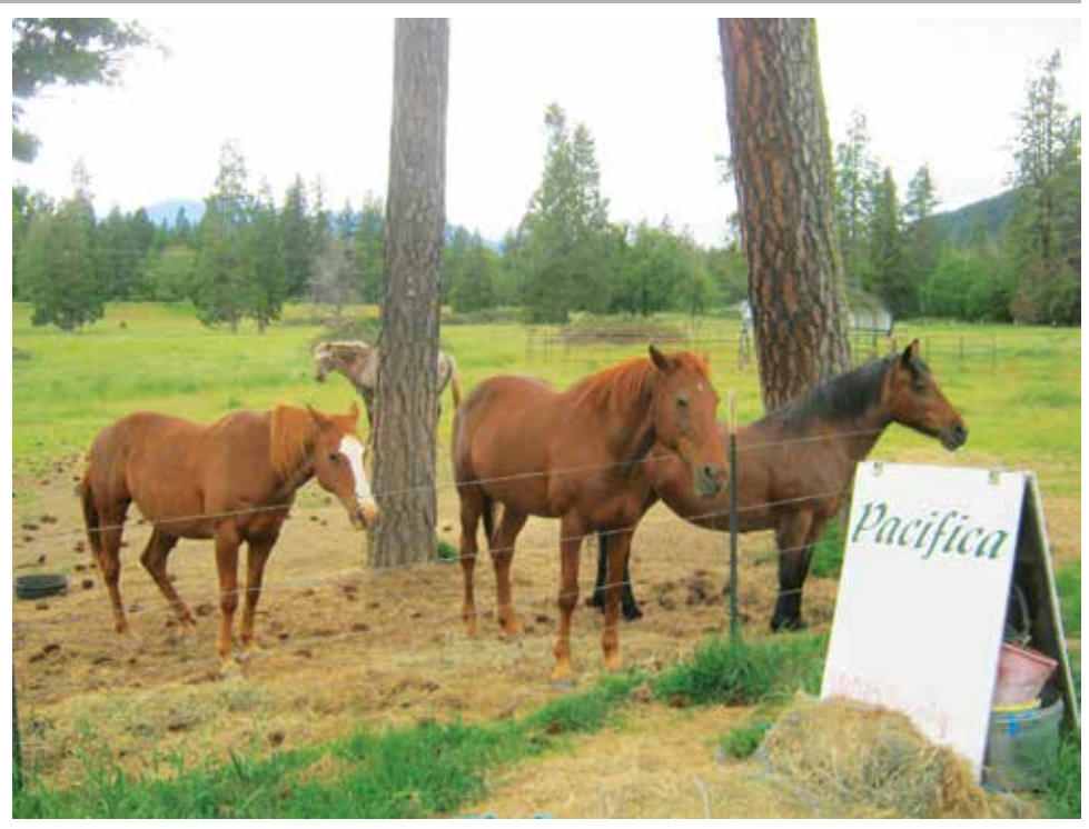
The Pacifica herd is rested and ready for the summer. From left are Shelby, then Whisper and Oyasin. Their blind ward, Star (dappled gray), is behind them in the back.

created a delightful, accessible-to-all trail and outdoor sculpture museum. The trail is level and smooth enough for wheelchairs, walkers, and strollers. This new Art Nature Trail (ANT) gives visitors an art-filled outdoor adventure in a lovely natural setting. In addition to the beauty of nature and the sculptures made by local artists, visitors will find activities to encourage artistic inspiration as they meander along the trail: hands-on sculpture activity stations for kids and kids-at-heart, along with special nature magnifiers. There will also be tables and benches for you to relax and just enjoy the specialness of where you are. Come and visit our new happy place!