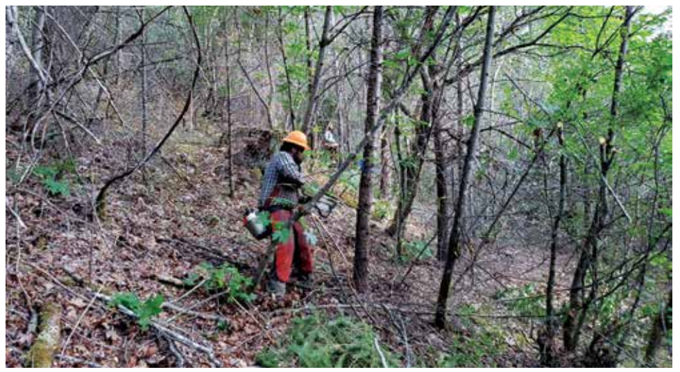
A Lomakatsi crew member thins brush and smaller diameter trees, setting the stage for reintroducing low-intensity prescribed fire as part of the Upper Applegate Watershed project.