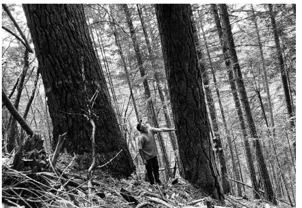
The Penn Butte Timber Sale has been leave-tree marked, meaning only trees marked with yellow or red paint will be retained. Luke Ruediger looks up at a large (33-inch diameter) ponderosa pine tree identified for removal.