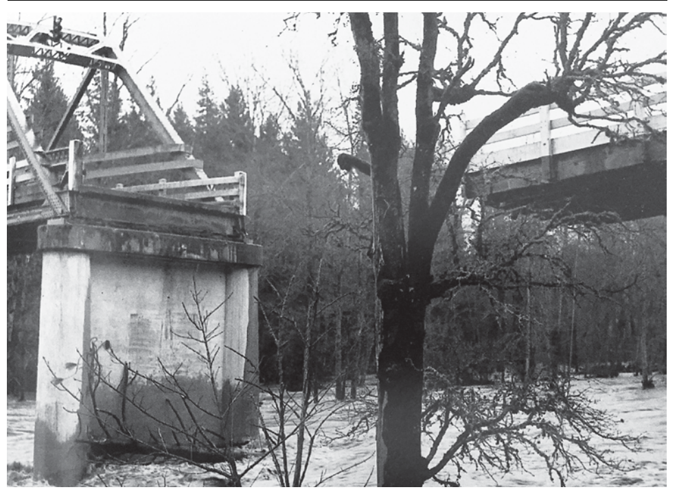
Flood-damaged Applegate Bridge in December 1955, near the mouth of Slate Creek.