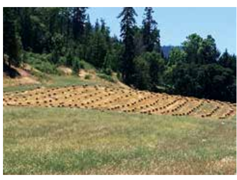
A hayfield on Thompson Creek Road.