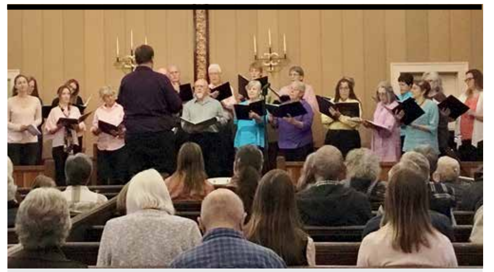
Voices of the Applegate in 2020.