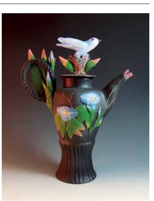
This piece is called Bluebird Morning Glory Tea.

Her work has always been inspired by nature, totem animals, plants, and flowers, so living and working in the Applegate has been a "natural" fit. Her style-featuring vases, teapots, perfume bottles, and bowls adorned with water lilies, herons, frogs, hares, fruits, and even dragons-suits a range of tastes. Friendly to the curious, be they young or mature, she explains her technique of using simple tools and animal totems, inspired by Native American and Western mythologies and fairy tales, that characterize her work. Recently she has been using Bluebird and Morning Glory as well as the Raven and Oak and Acorn symbols.