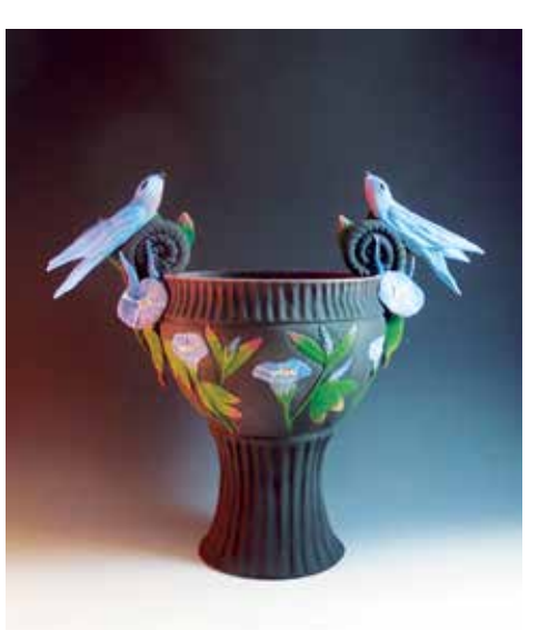
Bluebird Morning Glory Vessel.