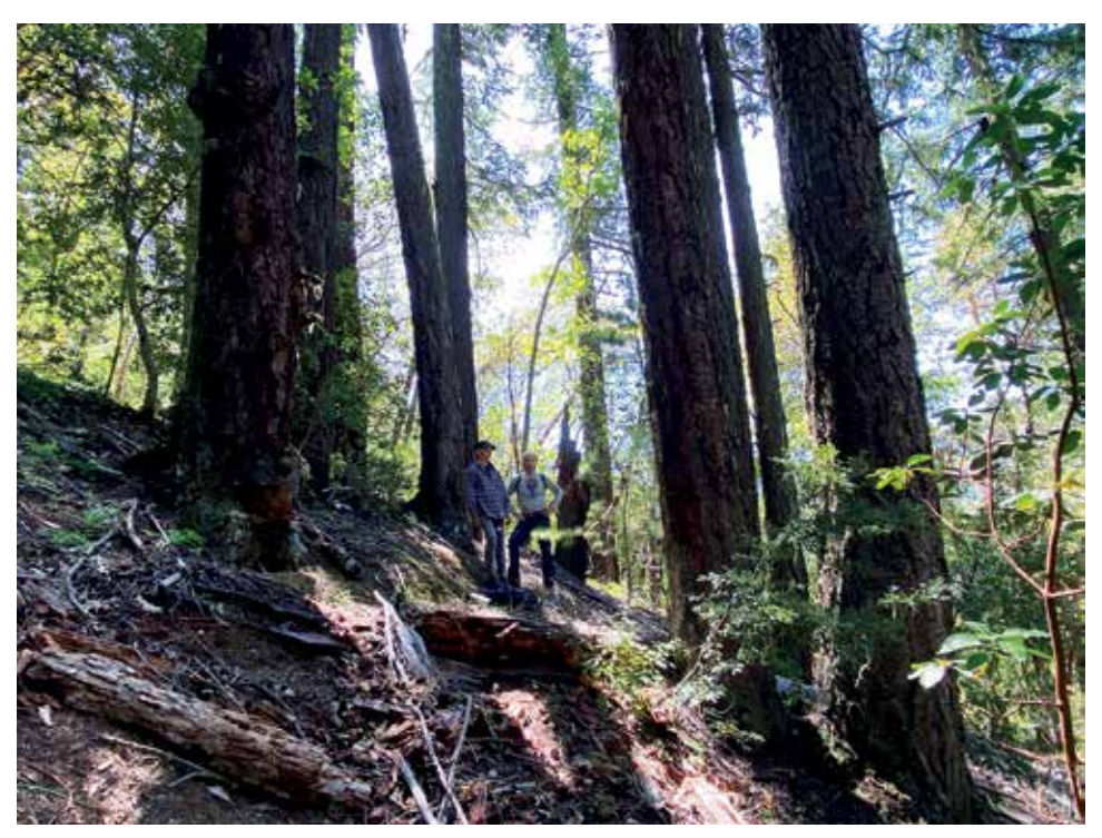
Hikers stand in a grove of trees proposed for logging in the Penn Butte Timber Sale above Williams, Oregon. Every large tree in this photograph is proposed for removal in a "group selection" harvest. Like other timber sales currently proposed by the BLM in the Applegate Valley, the Penn Butte Timber Sale was developed without the benefit of meaningful public involvement.

Currently very little is known about the Big Ben LSR Timber Sale, and the BLM is refusing to provide information on this sale to either the public or elected officials. Working totally in the dark, the agency has refused to provide basic information on the location of timber sale units and is designing yet another Applegate Valley timber sale in secret, with no public accountability or input.