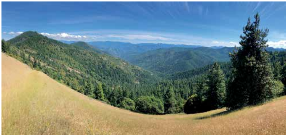
A view from the soon-to-be-created Tallowbox Trail in the Burton-Ninemile Lands with Wilderness Characteristics area.

The Tallowbox Trail will provide trail access into a beautiful and little-known portion of our region. The Burton-Ninemile LWC is one of only two habitats in the Applegate Valley currently