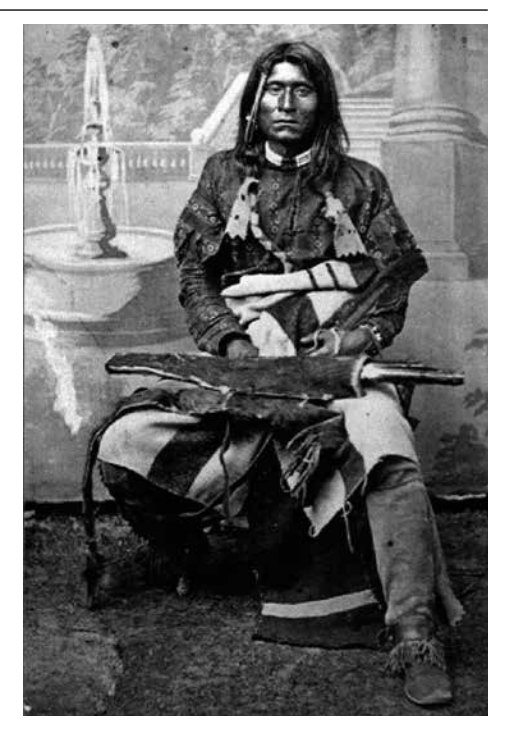
Portrait reportedly taken in 1864; photographer unknown. Set may have been erected outside.