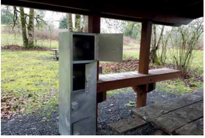
The new hiker-biker site for Cantrall Buckley Campground is modeled after this unit at Champoeg State Park in the Salem, Oregon, area. A partial wall will be added behind the counter for weather protection, as well as a pitched roof for better wind-resistance in our area.

members who volunteer to help with our enhancement projects. Thank you again for your service at our Jackson