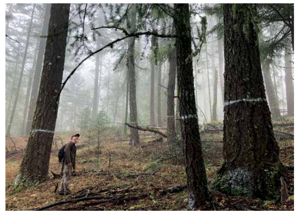
Whole groves of large old dominant trees are proposed for logging in Unit 13-6 of the Bear Grub Timber Sale along the popular East Applegate Ridge Trail.

They have also designed and are getting ready to sell the Lickety Split Timber Sale