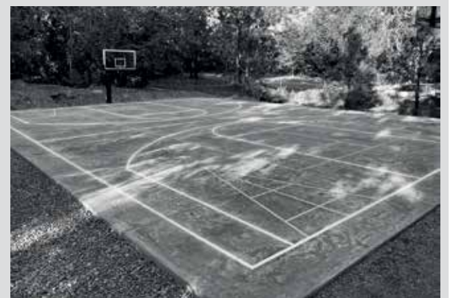
AGA contributed to the creation of this sports court in Williams, which meets the Applegate Valley Vision of making more shared spaces "to enhance community connections."