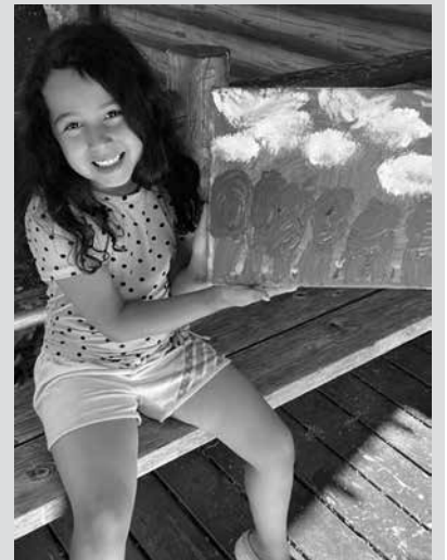
An Innovation Grant funded opening hours for Open Studios.