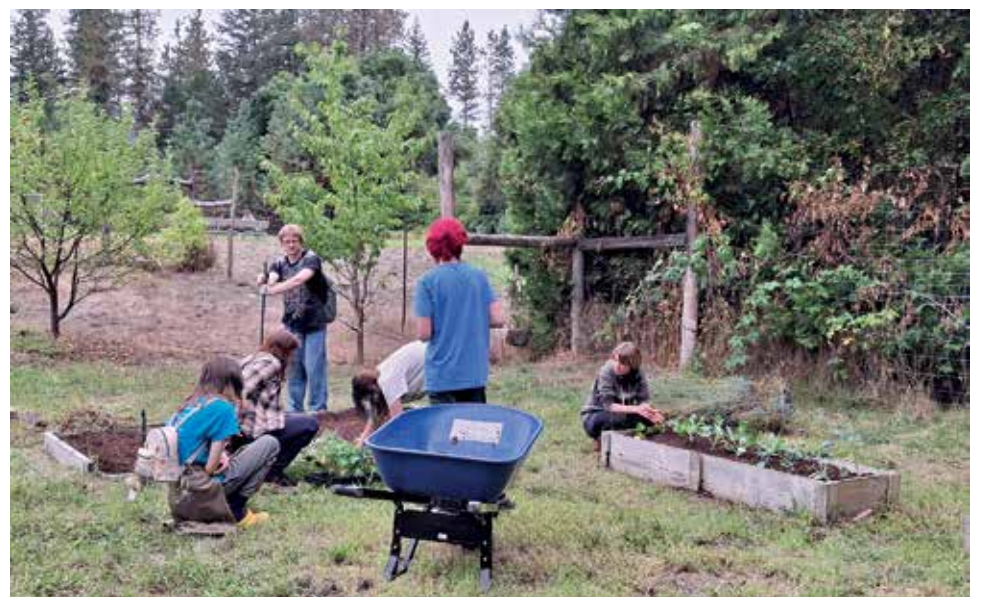
Volunteer helpers from the teen drop-in center work on the revitalized garden space on the Sugarloaf Community Association property.