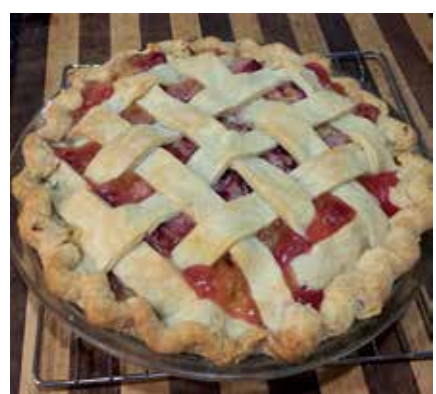
Homemade pies will be available to purchase on McKee Bridge on December 14.