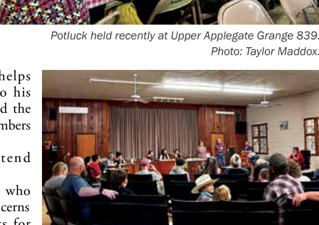
First meeting of the newly reorganized Upper Applegate Grange.