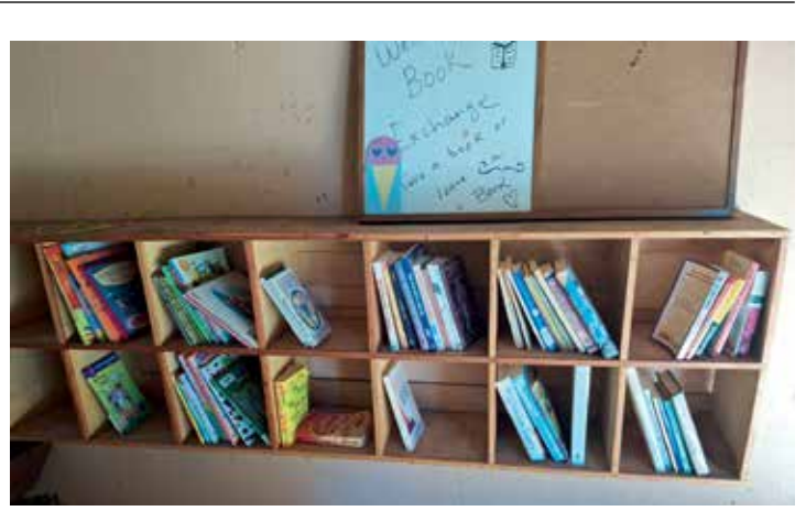
Meraki Project started a free wellness book exchange, along with a kids' book and toy exchange.

Check out the schedule on the Sugarloaf Community Association website