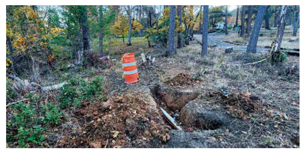
Park personnel are in the process of opening up valve intersections and replacing electric valves with air-pressure valves.

As mentioned in the last issue of the Applegater , Jackson County Parks will be replacing some trees removed from the lawn areas with hardier species. At our spring park gathering, we were able to raise funds through generous donations from private individuals. The APWC staff will coordinate with the park enhancement committee and park management to determine the best species to provide shade and survive the changing