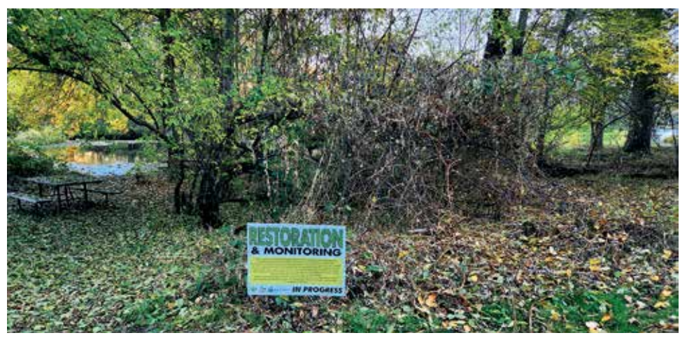
Students from Ruch Community Outdoor School (ROCS) continue to help with maintenance of blackberry vines that were initially cut in spring 2024. Students also helped plant new tree species and are learning how necessary maintenance is for the survival of new native species.

climate conditions at the park. With help from some local nonprofits, we hope to begin planning and implementation in 2025. If you are interested, please contact me (contact information below). Replacing trees in a mature tree setting takes replanting with trees that have four to six years of growth, so that they can also become dominant trees in the setting.