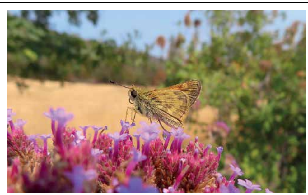
Ventral view of a Sachem Skipper, part of the grass skippers family, on a tall verbena plant in the Applegate School Butterfly Garden.

Males tend to perch on the ground awaiting females. Females deposit a single egg on grass blades dried by the morning sun. Sachems have one brood, with the larva overwintering in the first instar (a stage in larval development between molts). Larvae feed on the leaves of grasses