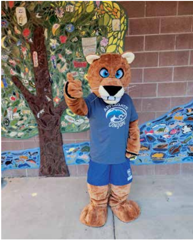
New cougar mascot costume at Applegate School.

Students at Applegate School were eager to return after being away all summer. Teachers and staff welcomed them back with smiles, high-fives, and a brand-new cougar mascot costume! The middle school student leadership group purchased the costume to instill pride at school events and get students excited. The school year has been busy through the first quarter and filled with many fun opportunities for learning. Active, hands-on learning is a theme across all grades for the first quarter.